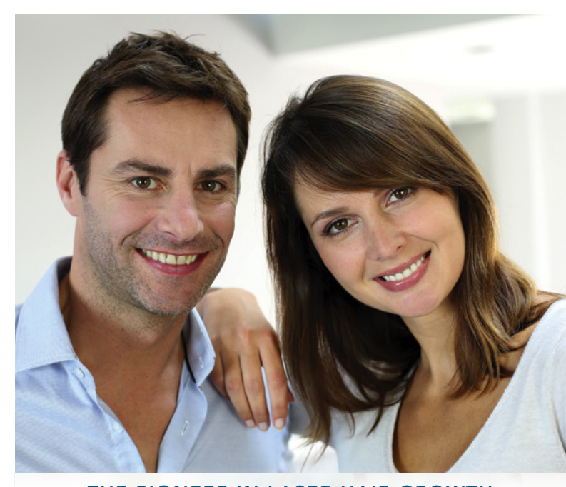
THE PIONEER IN LASER HAIR GROWTH